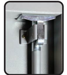
Door head frame pre-drilled to accept top trip and top shoot.