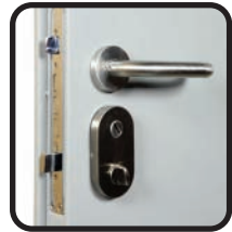
Independent internal thumb turn lock.