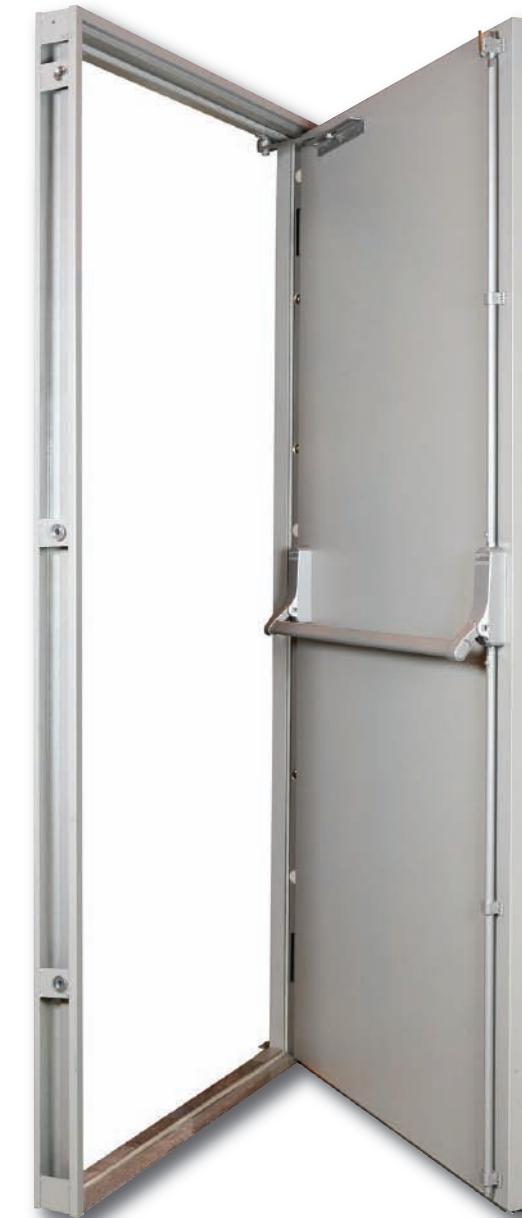
Door leaf prepared with threaded nutserts located to accept Exidor 294 panic bolt (panic bolt supplied loose complete with shoot tubes cut to size).