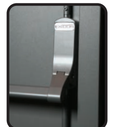
Door leaf is prepared for the Exidor 294 panic bolt.