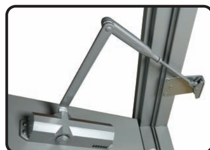
Arrone 6800 Door closer with adjustable closing speed/latch action.