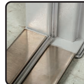
Stainless Steel Threshold 12mm high