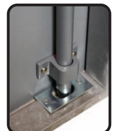
Threshold pre-drilled to accept bottom shoot and keep.