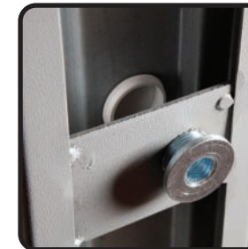
Adjustable Fixing Points 3 on both sides of frame