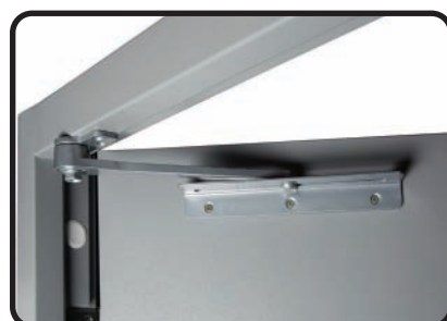
Door friction/limit stay, will restrict the doors opening to approximately 90 degrees.