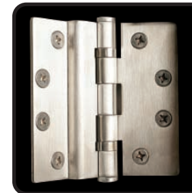
3 Stainless Steel Butt Hinges