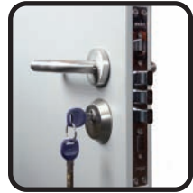
Multi point security lock.