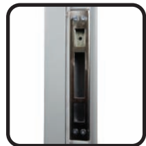
Central lock plate with adjustable latch keep.