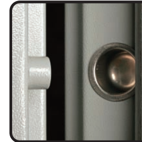
Anti-Jemmy Dog Bolts on hinge side of door