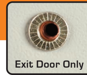
Exit Door Only Threaded Insert for easy installation of panic bolt furniture