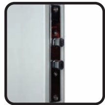
Extra locks at low & high level.