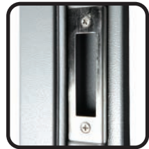
Re-cessed lock keep.